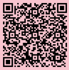
Talking is Teaching

Keep your child's PCP updated on any concerns you have about your child's development. Below are some resources with information and tools to utilize at home for supporting your child's development.