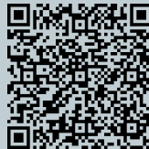
Autism Alliance Metrowest Resource Directory