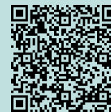
Boys and Girls Club