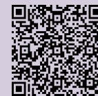
Pre-Employment Transition Services (Pre-ETS)