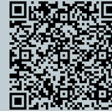
Insurance Resource Center for Autism and Behavioral Health

Information & resources on attention deficit/hyperactivity disorder (ADHD):