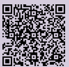
BMC Autism Program Transition Resources