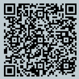
Healthy Children ADHD Resources