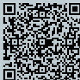
Autism Support Centers