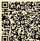
Family Support Centers

Connect with other families to discuss shared experiences, learn about resources, and grow your support network. Support groups for families are available across MA. Connect with a Family Support Center, Family Voices or The Arc to find a support group. To speak with families about special education in your school district, join your district's SEPAC. The Sibling Network offers siblings of children with disabilities the chance to connect with other children in a fun, supportive environment.