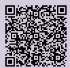
Department of Developmental Services (DDS)