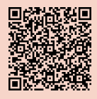
Water Safety Guide