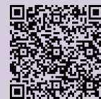
Transition Planning in High School

Explore information on transition to adulthood supports in school, (transition planning in high-school & Pre-ETS), independent living supports (ILCs), state agencies (MassAbility & DDS), life skills resources (Healthy Relationships curriculum), supported decision-making, and general transition to adulthood resources.