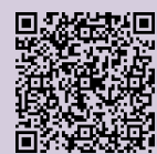
Supported Decision-Making (SDM)